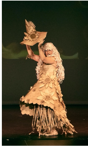
Reiteration by Amy Louise

Textured, restructured, and reconsidered paper bags became